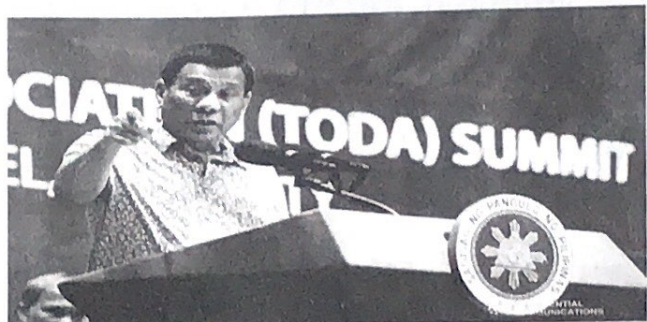
President Rodrigo Roa Duterte stresses at a point as he delivers his speech during the Tricycle Operators and Drivers' Association (TODA) Summit at the Cuneta Astrodome in Pasay City on January 23, 2019.